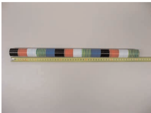
FIGURE 2.1 The novel object.

The touch test was also carried out at the three locations in the house. The observer gently sat down. From the birds that were in reach of the observer, the observer tried to touch a maximum of 12 birds. If less than 12 birds could be touched, a maximum of 12 trials per location was carried out. The ratio between the number of birds touched and the number of birds in reach (for all locations) was calculated. The avoidance distance test was