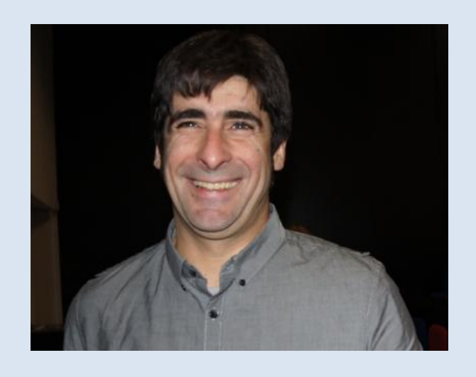
Welfare Quality Work at IRTA in Spain

Since their initial development the WQ protocols have been tested, used and adapted by numerous animal welfare scientists and professionals for a range of different purposes. An inventory of work carried out by the partners of the Welfare Quality Network at the end of 2012 found that there were 46 current or planned projects that were based on the WQ project. The projects focused on several different species, including cattle, pigs, laying hens, horses, broilers, rabbits and mice. Many of the projects also involved close collaboration with industry partners. In the next section we showcase some of the recent work being carried out in research institutes in Spain and Belgium. This work aims to develop and improve the WQ protocols or to assess their potential in novel contexts.